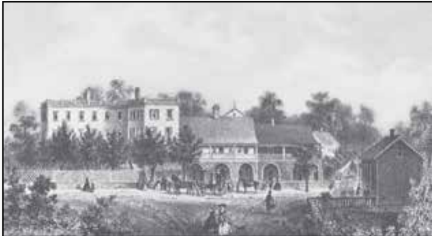
Music Vale Seminary, circa 1840