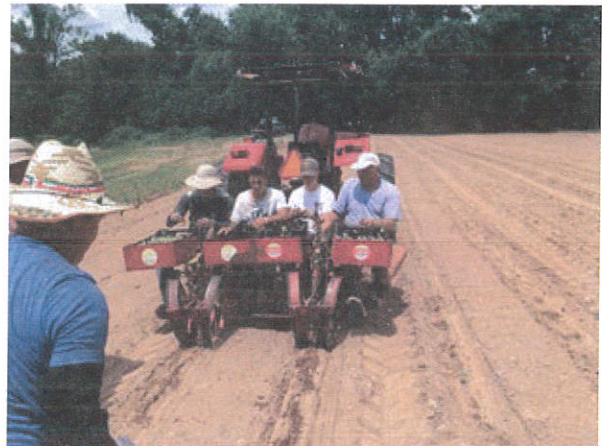
Planting fall broccoli at Ives Farm in anticipation of the coming rains.

This summer's weather has been a challenge for farmers, but the news is upbeat from CLT's Jim Mertz, who shares the latest from 1585 Cheshire Street: “Mike and Joe and men have been busy working the fields. Ives corn is now available along with zucchini and yellow squash at the farm stand. Beans, radishes, beets, broccoli, cabbage, tomatoes, swish chard, eggplant and a variety of peppers are being grown, too. Before the recent downpours, the lack of rain delayed some produce from being harvested. Work continues to complete the barn and greenhouse with lamps and electrical switches being installed. The new greenhouse is nearing completion.”