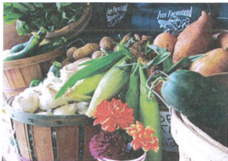
T&D Farmstand at Ives Farm