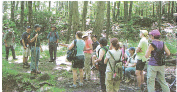
A great turnout for June's CT Trails Day Hike

As busy as it has been, there's so much more yet to come. Please come by any of the CLT events. We'll be glad to see you.